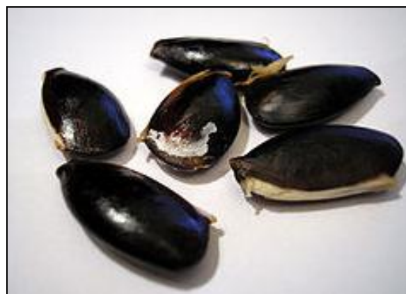
Fig 1: Manilkara zapota (L.) seeds

Manilkara zapota L. belongs to the family Sapotaceae. It is an evergreen, glabrous tree, 8-15 m in height. It is cultivated throughout India, though it is native to Mexico and Central America. The seeds are aperients, diuretic tonic and febrifuge. Bark is antibiotic, astringent and febrifuge [6-7]. Chicle from bark is used in dental surgery. Fruits are edible, sweet with rich fine flavour. Bark is used as tonic and the decoction is given in diarrhoea and peludism [8]. The leaves are used to treat cough, cold, and diarrhoea [9-10] Bark is used to treat diarrhoea and dysentery. Antimicrobial and antioxidant activities are also reported from the leaves. The objective of the present study was to evaluate various phytochemicals and anti-inflammatory profile of seeds of Manilkara zapota L. seeds.